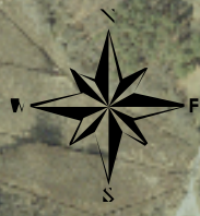
FIGURE 7d SUFFOLK COUNTY VECTOR CONTROL OPEN MARSH WATER MANAGEMENT DEMONSTRATION PROJECT AREA 4 - MARSH COMPOSITION MAP