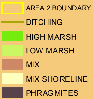
FIGURE 7b SUFFOLK COUNTY VECTOR CONTROL OPEN MARSH WATER MANAGEMENT DEMONSTRATION PROJECT AREA 2 - MARSH COMPOSITION MAP